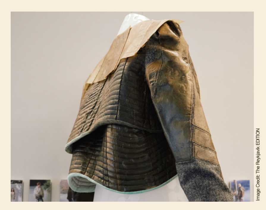
Move away from fast fashion to sustainably produced clothing, like those tailored from seaweed

The sewing classes of old sought to cultivate self-sufficiency and resourcefulness. Our new take on these Home Economics classes shares the same spirit by showcasing circular manufacturing methods and unconventional materials that can give the fashion industry its much needed sustainability makeover.