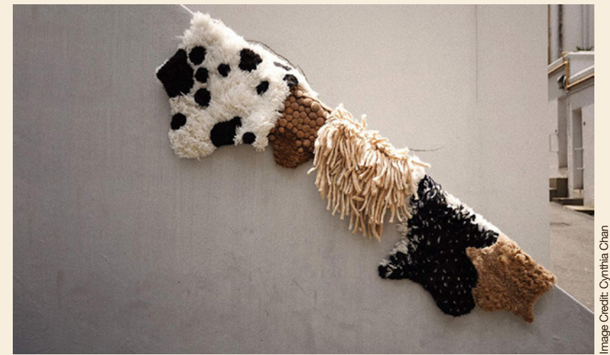
Make the switch from "PET" to "pet" with textiles woven from dog fur instead of polyester