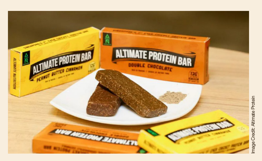
Rich in protein, insects and larvae require much less resources to farm

The canteen doubles up as Food & Consumer Education, dishing out meals that are not only nutritious but healthful for the Earth too. On the menu, find unusual and overlooked foods that can help bridge the shortfall between diminishing resources and a growing population.